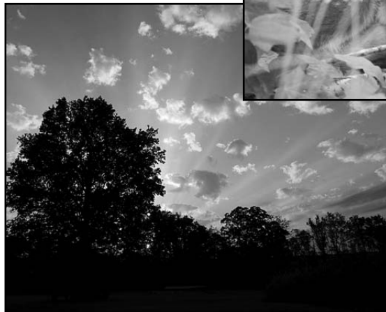
Youth - Landscapes/Plants Sunset Over Funks Grove Grace Marcy