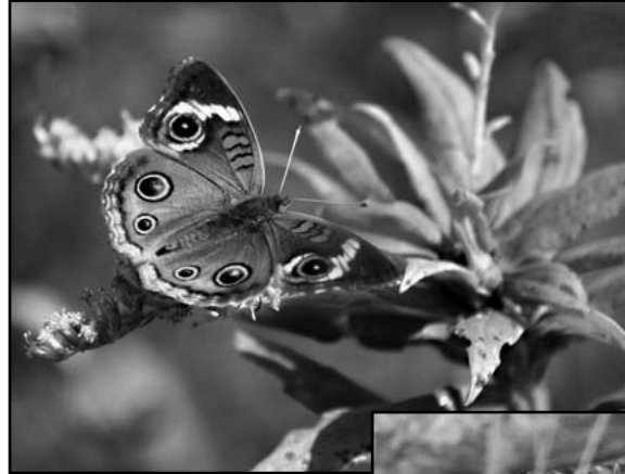
Best of Show Butterfly Buckeye Troy Marcy